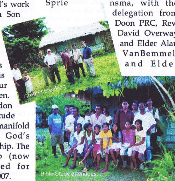
Bible Study attendees