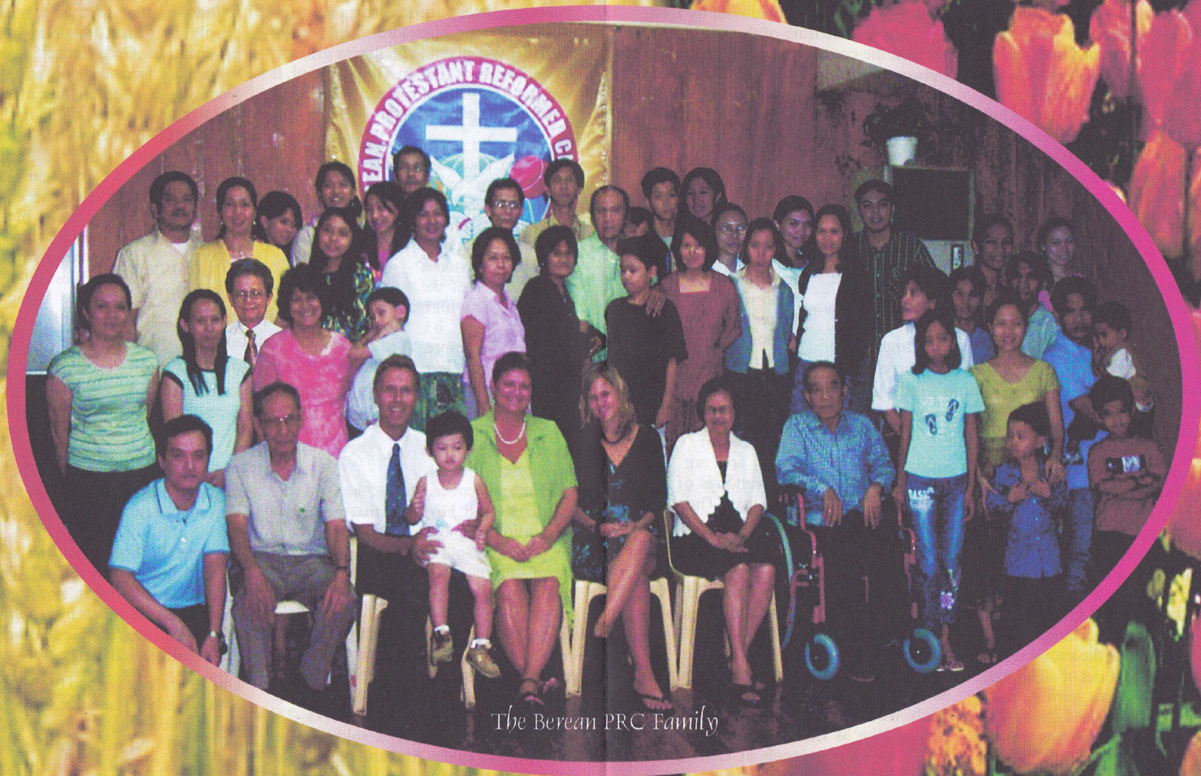
The Berean PRC Family