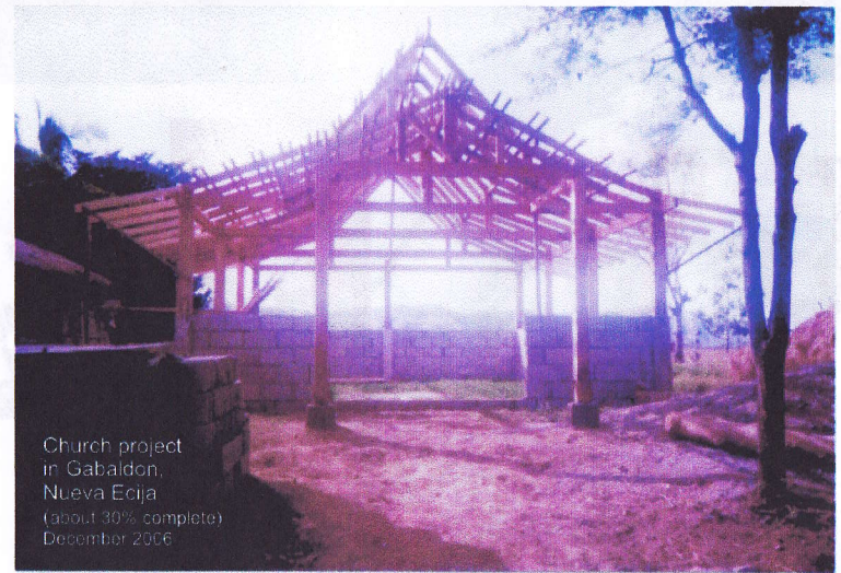
Church project in Gabaldon, Nueva Ecija (about 30% complete) December 2006

Late in the afternoon, yours truly was again privileged to conduct a Bible study, also in Tagalog, in