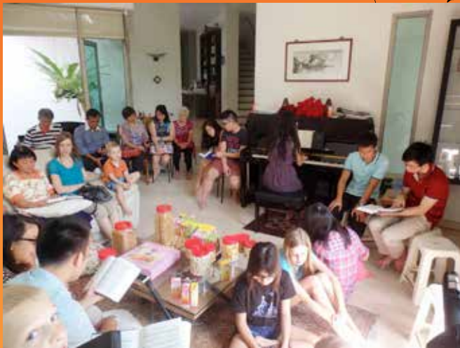
Church CNY Visitation - a time of fellowship with exhortation, singing and lunch