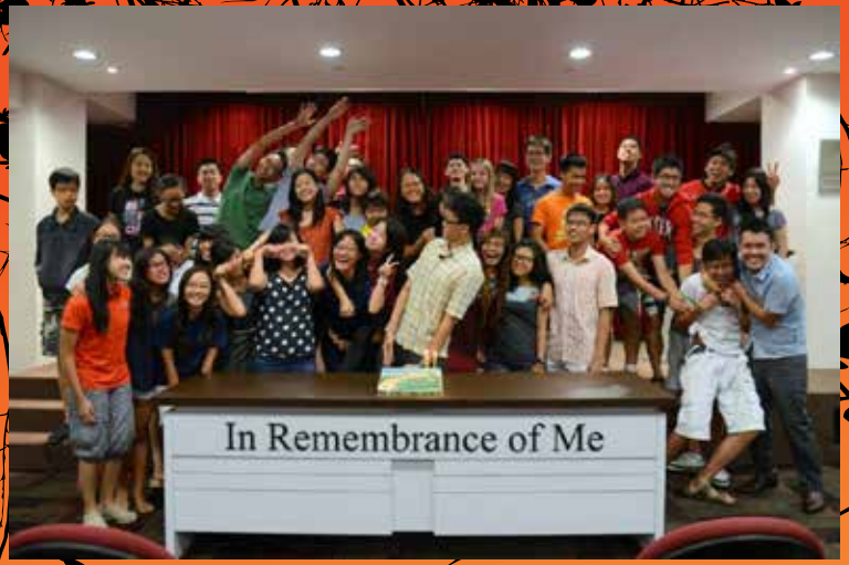
Commemorating CK's 15th anniversary and CKS' 7th anniversary