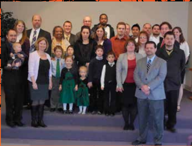
The congregation of the Protestant Reformed Fellowship of Pittsburgh, PA