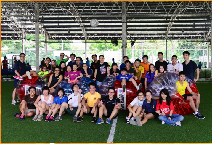
After a rollin' good time of "Bubble Soccer" during CK/CKS Camp