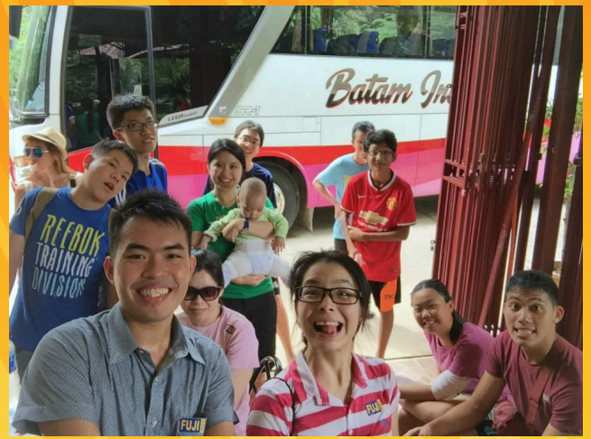
Wefie contest at CERC Annual Bible Camp 2015 in Batam