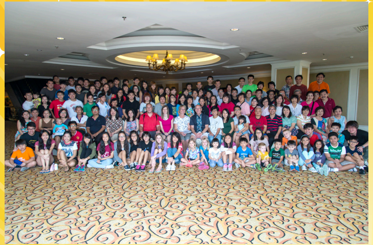
Last day of Camp: Ready to Meet Christ?