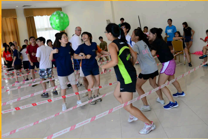
Games at Church Camp: No holds barred "Human Foosball"