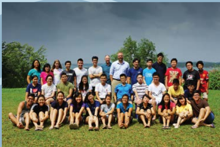
CK/CKS Camp 2015