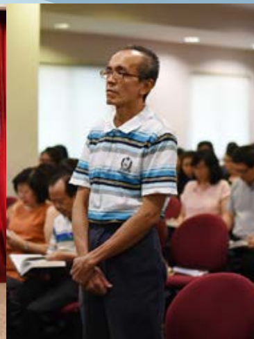
Baptism of Kuang & Confession of Faith of Huggy