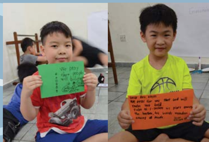
Letters to missionaries from Vacation Bible School's campers